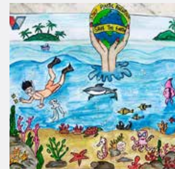
Valvoline Employee Winner