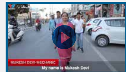
Click play to learn more about Devi's journey