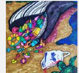
Winner Ages 4-11 Years

Participants were segmented into three groups: ages 4-10, ages 11-18, and Valvoline employees. The inspiration for the contest was the effect plastics have on marine life, so our participants were challenged to create posters that reflect an ocean, lake, river, or stream free of plastics. Regional finalists were selected by managers, and category winners were chosen by global employee vote. A donation was then made to the charity of the winner's choice in each category.