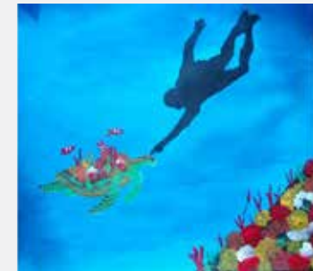
Winner Ages 11-18 Years