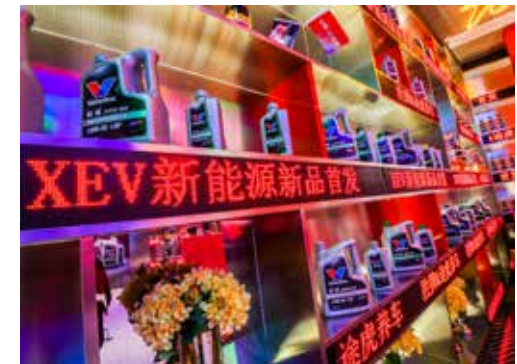
Valvoline launches XEV hybrid, plug-in hybrid and pure EV product suite in China

Chang Yu Vice President, Valvoline Global Products